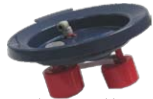
Float Assembly: WCLPT-W601-4000