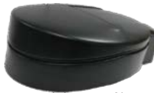
Baltik & Pacifik: WCLPT-B170-2020