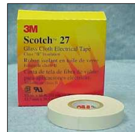
High Temperature Tape